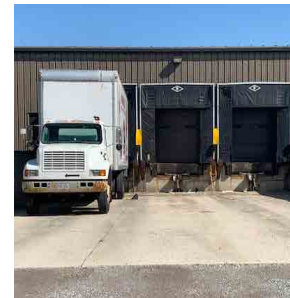
NO JOB TOO BIG